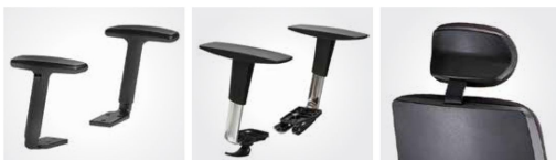
490 Height adj. nylon arm, PU or nylon top. Bracciolo in nylon reg. in altezza, top PU o nylon. 397 NR 2D steel armrest, black top. Bracciolo in acciaio 2D, top nero. 760 Black height adj. headrest. Kit poggiatesta reg. in altezza nero.