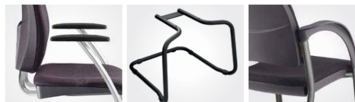
850 CR Chromed cantilever with arms. Cantilever cromato con braccioli. 880 NR Black stackable cantilever. Cantilever impilabile nero. 371 4 legs frame with arms, black. Struttura 4 gambe con braccioli neri.