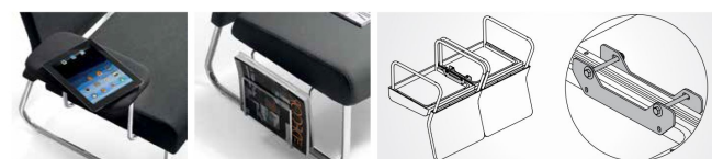
993 Armrest (Tablet holder). Bracciolo porta tablet.