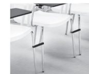
1123 Plastic link Link in plastic