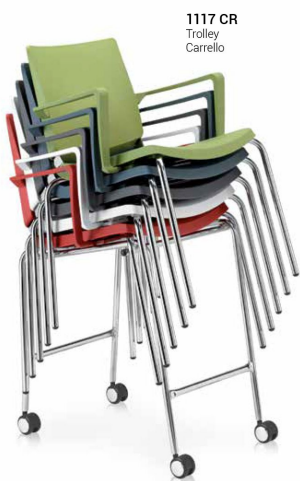
1117 CR Trolley Carrello

For ATENEA BEAM 2 or 3 seater structure in high resistance steel with plastic elements. Available finishing: epoxy gray painting; epoxy black painting; magazine holder for beam in lacquered plywood.